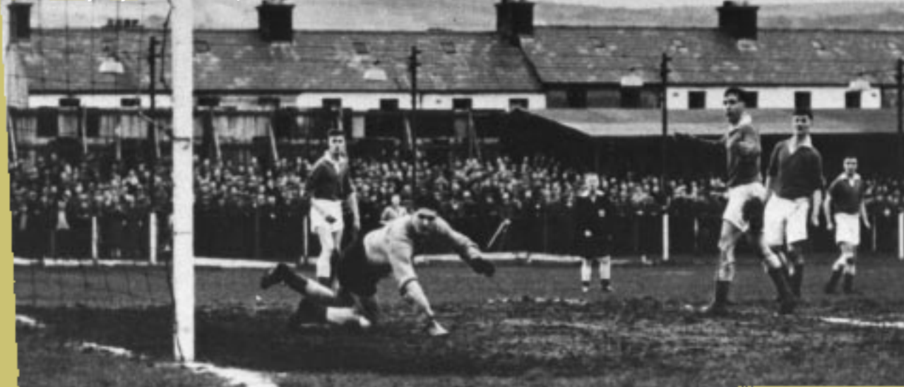
RUC v Derry City in the Irish Cup at the Brandywell, 1960