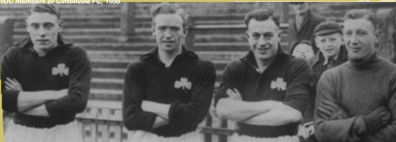
RUC members of Cliftonville FC, 1938

First Round: - Glasgow Celtic 3 corners, Brantwood 0; Linfield 2 corners, Glentoran 0; Glasgow Rangers, 2 goals (McIntyre), Distillery 0; RUC 2 goals (Brown), Portadown 1 goal (Silcock).